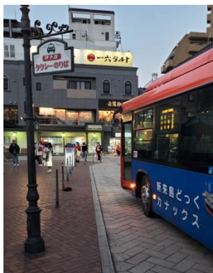
⑦ Bus Stop : Dogo Onsen Station