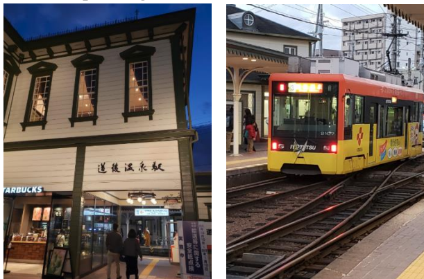
⑧ Tram Stop : Dogo Onsen